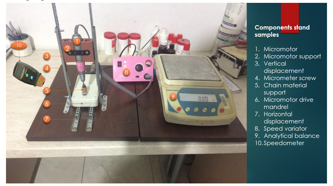
Fig. 6. Stand dental milling tests [10]

After conducting the test samples according to the validation standards, measurements shall be made weighing both the test material and the test cutters.